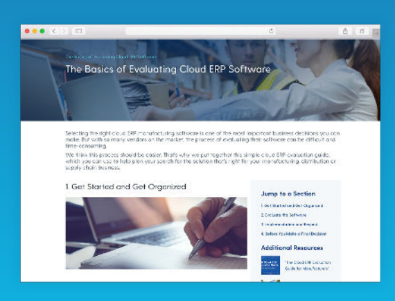
<u>Cloud ERP</u> <u>Overview Video</u>