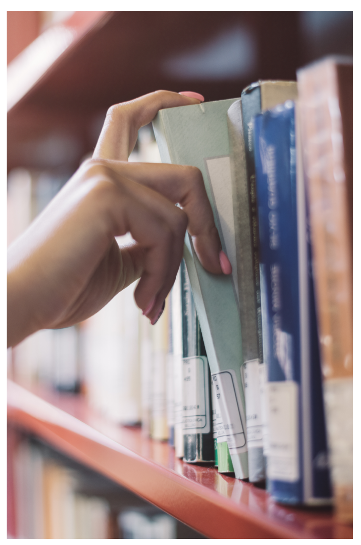
Sage Intacct produces custom invoices based on each publisher's activity, saving several days of manual work.