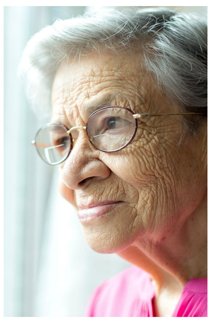
For the first time, Meals on Wheels America has real-time visibility into expenses booked against a particular grant, with Sage Intacct.